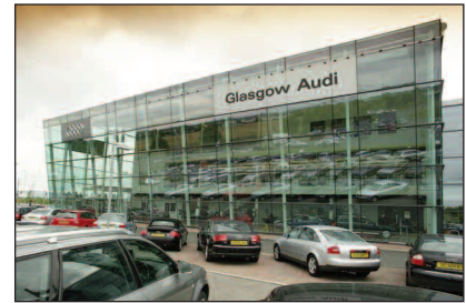
Glasgow Audi Ltd - More than just a car dealership

Scotia UK plc, a Smart-e accredited installation partner has completed a series of works with Glasgow Audi Centre, a pioneering dealership which is the largest of its kind in the world.