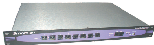
There is no impact on the network with the Smart-e SmartNet X+ as AV signals are distributed via Cat5e cabling

Scotia UK created a fully networked audio visual solution that centers around a wireless touch panel control system and a Smart-e SmartNet X+ 16x16 matrix switch that routes information to a series of displays, when and where it is needed. These displays consist of nine plasma and LCD units located in prime viewing positions around the show room.